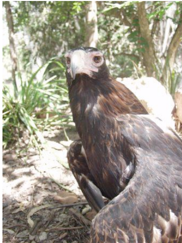
Wedge Tailed Eagle

Fill in the tables below by describing the type of feeding method the animal uses and its diet, and also the physical characteristics of the animal (eyes, wings and/or tail, head) and how it affects its behaviour.